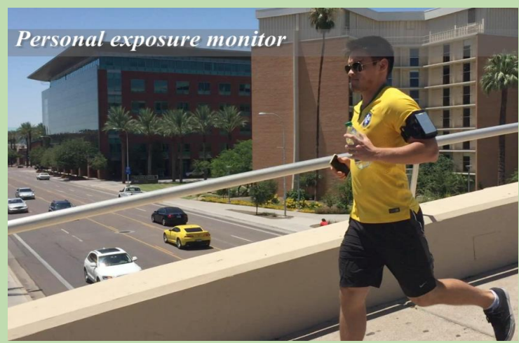
Personal exposure monitor

3- Wear the monitor & monitor your exposure level anywhere!